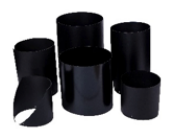
Full range of visors