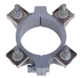
4 Point Lower Mount Bracket (LMB)